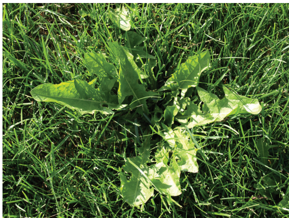
BEFORE TREATMENT WITH FIESTA