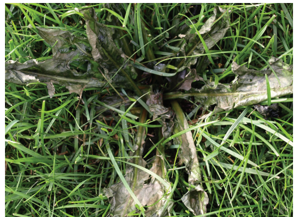
24 HOURS LATER